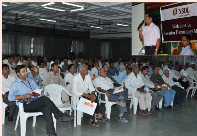
Investor Depository Meets (IDMs) organised by NSDL at Kalol & Nadiad in Gujarat on June 7 & 8, 2013 respectively.